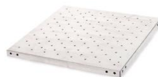
30400052 Universal Platform, 28 × 33 cm