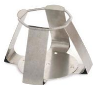
30400096 6 Liter Erlenmeyer Flask Clamp