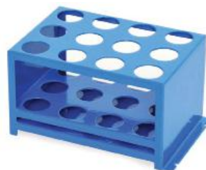
30400120 Test Tube Rack For 50 mL Tubes