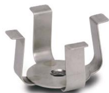
30400093 3 Liter Erlenmeyer Flask Clamp