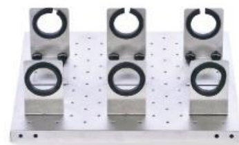
30400083 Separatory Funnel Platform, 46 × 46 cm