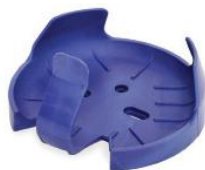
30400102 Flask Clamp PVC 1000 mL